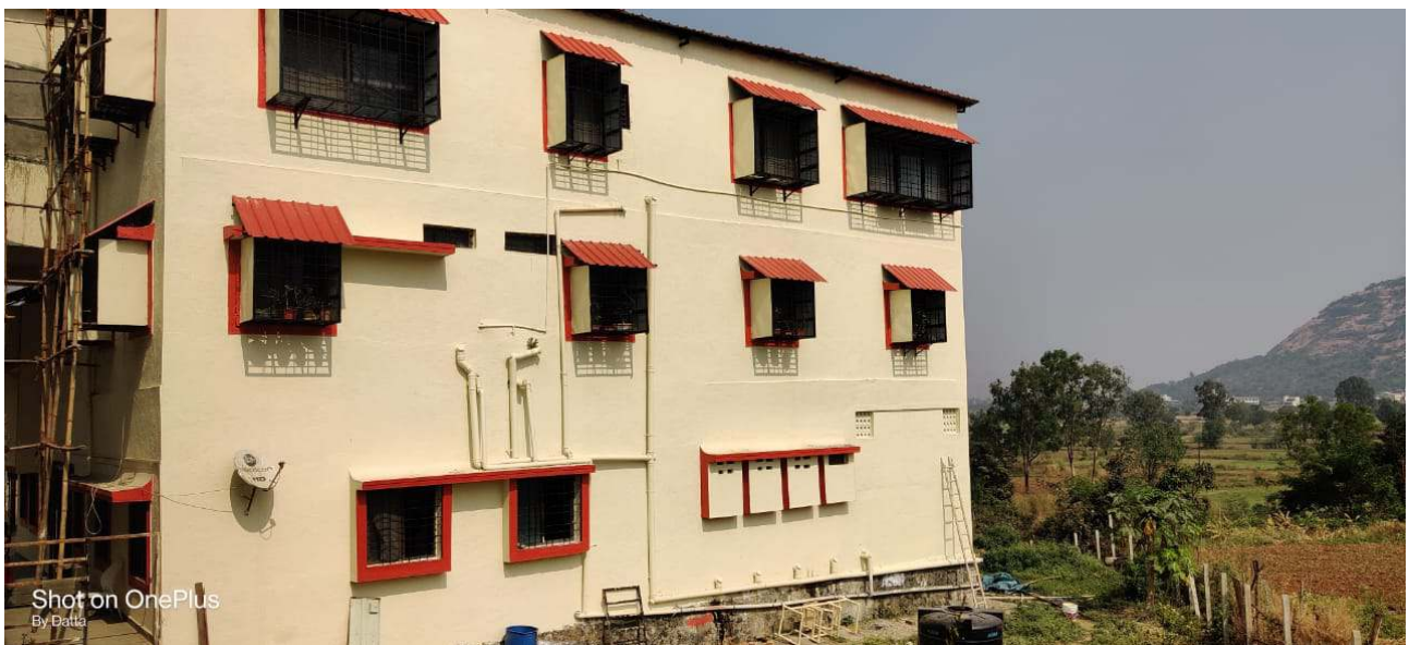
the Back side completed.